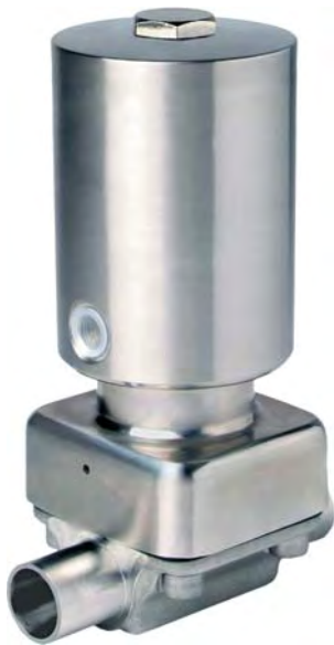
DN 15 - 50 Cf. 4