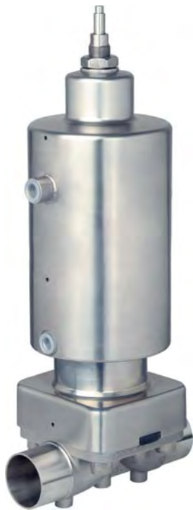
DN 50 Cf. 4